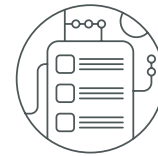
Lesson 2 Healthy Planning

97% of elementary school teachers believe nutrition education is important 1 .